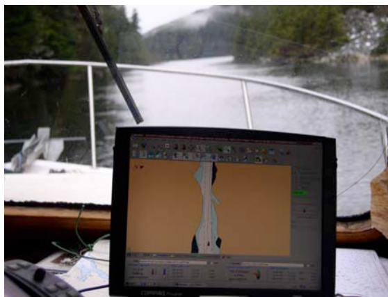
GPS 8 ft Depth