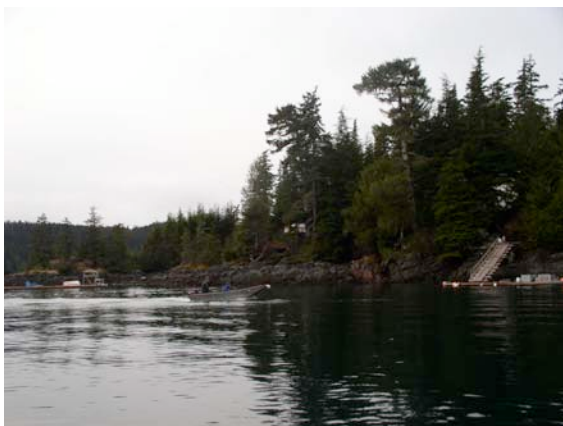
Going Home from School