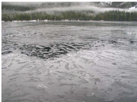
Breaking through the Ice